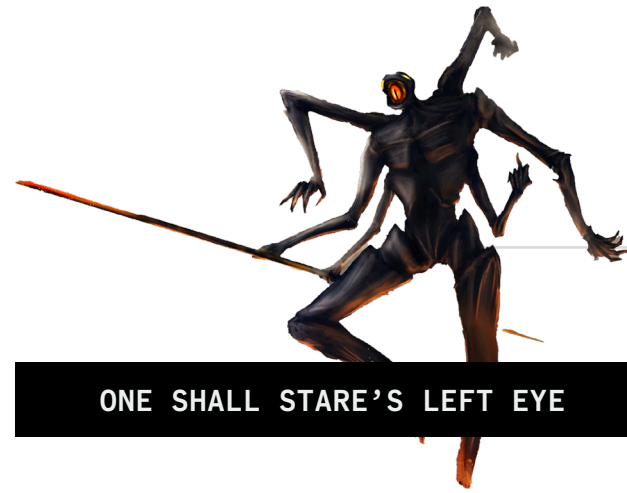
ONE SHALL STARE'S LEFT EYE